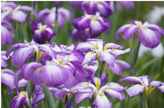
Camera: Sony α6600 Focal Length: 300mm Exposure: F6.3 1/200sec ISO: 100

The 18-300mm F/3.5-6.3 Di III-A VC VXD (Model B061) is an all-in-one zoom lens for Sony E-mount and FUJIFILM X-mount APS-C mirrorless cameras. It is the first 1 lens in the world for APS-C mirrorless cameras with a zoom ratio of 16.6x and 18-300mm focal length range (27-450mm full-frame equivalent). This all-in-one zoom lens covers up to 300mm telephoto and is well-balanced with aspherical and special lens elements to achieve high image quality over the entire range. Plus, like most of TAMRON's other lenses for mirrorless cameras, the filter size is unified at 67mm. This all-in-one zoom lens makes photography more fun because you can use it in an unlimited number of situations. It's so versatile, it will inspire your creativity.