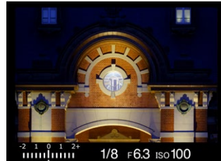
Simulated viewfinder image.