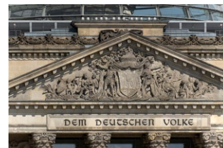
Camera: Sony α6600 Exposure: F6.3 1/3200sec ISO: 400