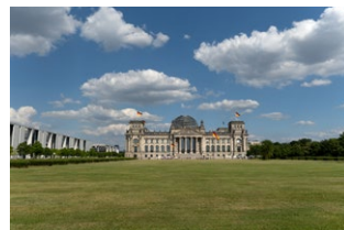
Camera: Sony α6600 Exposure: F6.3 1/4000sec ISO: 400