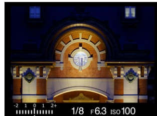
Simulated viewfinder image.