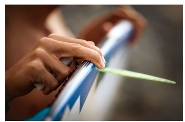
Focal Length: 200mm Exposure: F/2.8 1/2000sec ISO: 200

Improvements to the new SP 70-200mm F/2.8 G2 extend well into the lens barrel. Tamron has reduced the MOD from 1.3m (50.7 in) in our older model to 0.95m (37.4 in), allowing a maximum magnification ratio of 1:6.1. The shorter MOD, coupled with the superb optical performance of this new zoom, allows you to significantly broaden your range of expression.