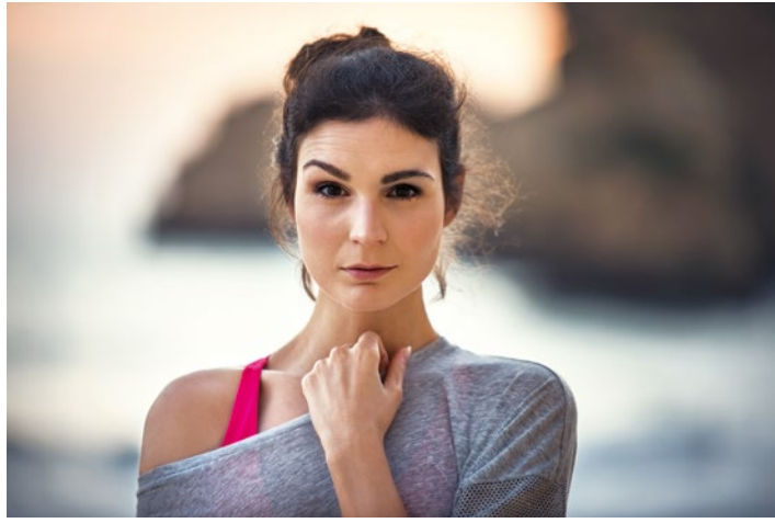
Focal Length: 200mm Exposure: F/2.8 1/80sec ISO: 200

Every aspect of the SP 70-200mm F/2.8 G2 has been improved, providing high image quality and enhanced bokeh throughout. Optical design features include XLD (eXtra Low Dispersion) and LD (Low Dispersion) glass to eliminate chromatic aberrations across the entire zoom range, ensuring optimum resolution— even at the edges. eBAND Coating designed exclusively for this new zoom offers superior anti-reflection properties, greatly minimizing flare and ghosting. And refined bokeh provides spectacular background effects from nearly any angle.