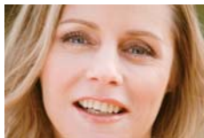
300mm (equivalent to 465mm)