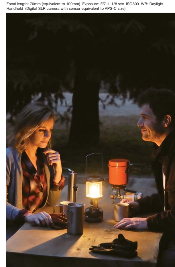
Focal length: 70mm (equivalent to 109mm) Exposure: F/7.1 1/8 sec ISO800 WB: Daylight Handheld (Digital SLR camera with sensor equivalent to APS-C size)

With an XLD lens element to deliver high resolution, image stabilization and a turbo speed silent autofocus, Tamron's new telephoto zoom makes it easy to capture the most difficult shots. Introducing the new SP 70-300mm F/4-5.6 Di VC USD.