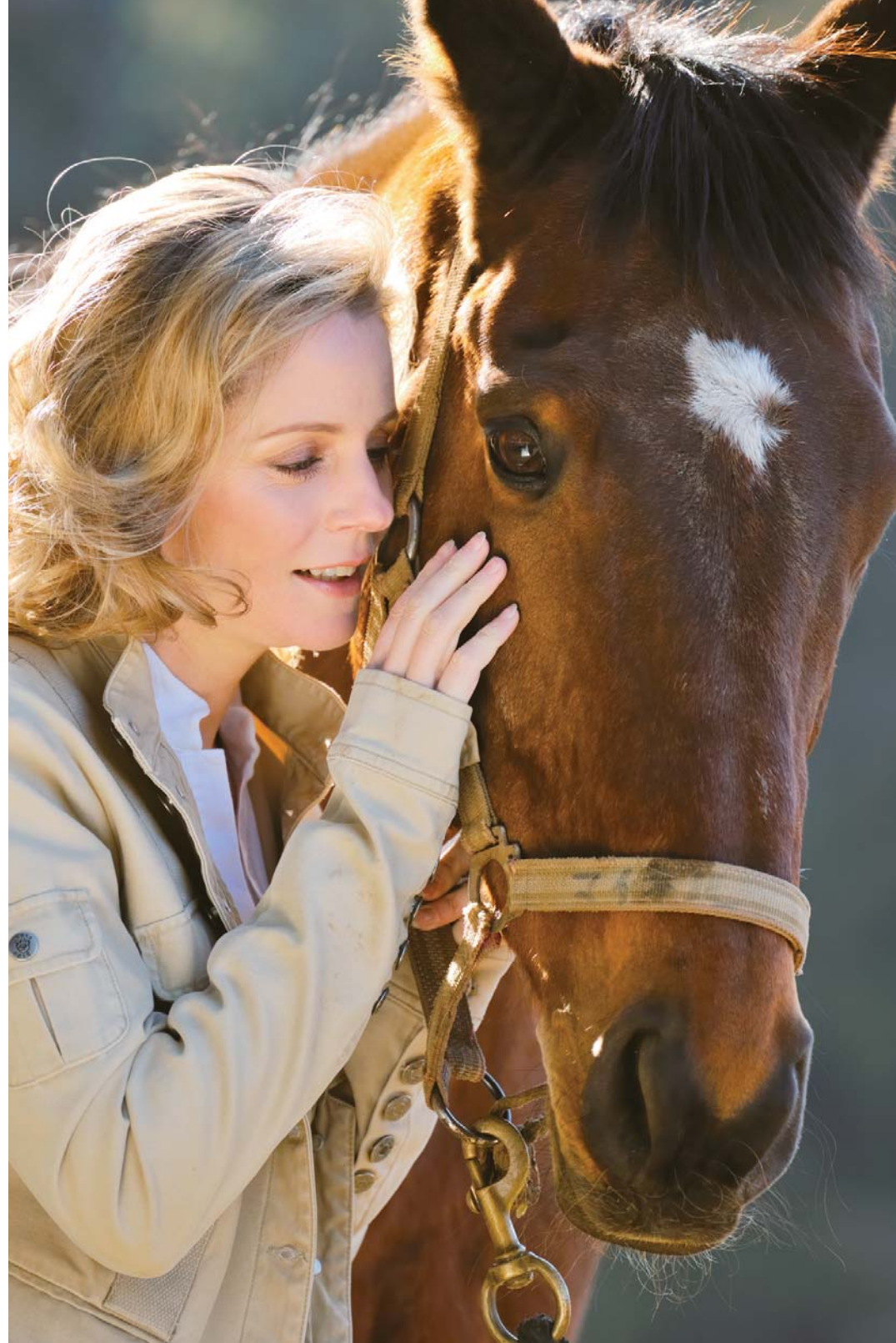
Focal length: 300mm Exposure: F/5.6 Aperture fully opened 1/200 sec ISO200 WB: Daylight Handheld