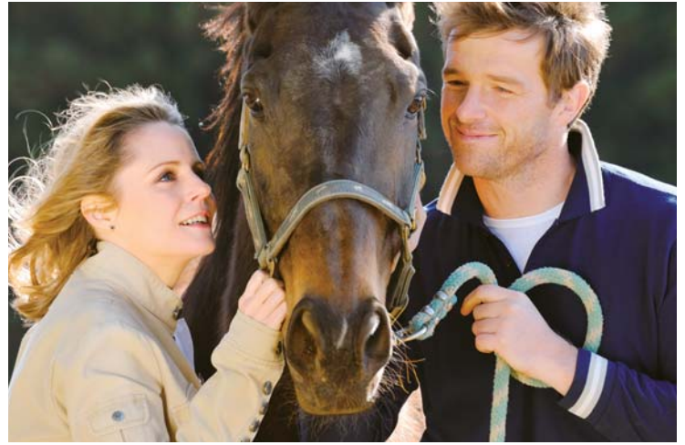
Focal length: 300mm Exposure: F/8 1/160 sec ISO400 WB: Daylight Handheld

The SP 70-300mm F/4-5.6 Di VC USD is one of Tamron's Di (Digitally Integrated) designs. The Di Series is the mark of Tamron lenses that are format-versatile since they can be used on digital APS-C, full-frame and 35mm SLR cameras.