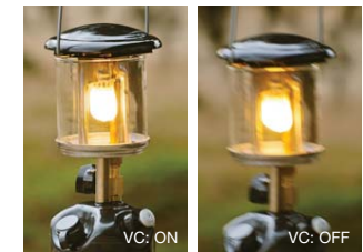
Focal length: 300mm Exposure: F/11 1/30 sec With VC, the photographer can shoot at a shutter speed up to four stops slower.

The new optical design of Tamron's advanced telephoto zoom lens delivers a whole new world of possibilities. It allows the photographer to draw the subject close and separate them from their background, creating photographs with spectacular contrast and depth. This lens also boasts Tamron's USD (Ultrasonic Silent Drive) and proprietary VC (Vibration Compensation) image stabilization. It gives the photographer the ability to capture fast moving subjects without blurring even in low light, and its new optical design that employs an XLD (Extra Low Dispersion) lens element made with highly specialized glass delivers crisp, clear images with sharp contrast.