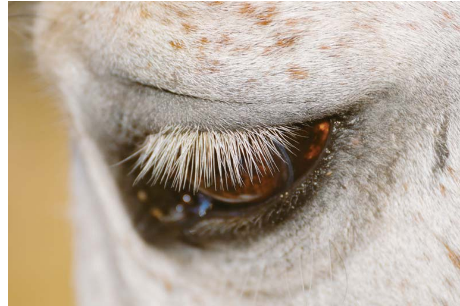
Focal length: 300mm (equivalent to 465mm) Exposure: F/5.6 Aperture fully opened 1/1000 sec ISO400 WB: Daylight Handheld (Digital SLR camera with sensor equivalent to APS-C size)