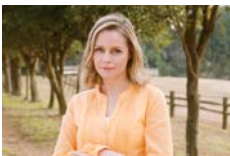
70mm (equivalent to 109mm)