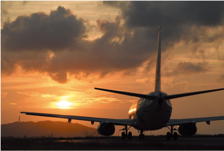
Focal Length: 140mm Exposure: F/14 1/200sec ISO: 200

eBAND Coating delivers sharp, clear photos