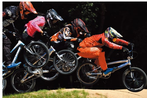
Focal Length: 300mm Exposure: F/8 1/500sec ISO: 200

Precise AF tracking and VC (Vibration Compensation) are essential to ultra-telephoto lens performance. Tamron's Dual MPU high-speed control system** helps make this possible. In addition to an MPU (micro-processing unit) with a built-in DSP for superior signal processing, the A035 features a separate MPU dedicated exclusively to vibration compensation. With AF tracking and enhanced VC, you can enjoy shooting fast-moving subjects with stability and ease—even in low-light.