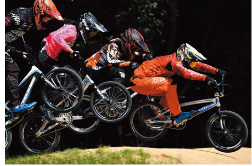
Focal Length: 300mm Exposure: F/8 1/500sec ISO: 200

Precise AF tracking and VC (Vibration Compensation) are essential to ultra-telephoto lens performance. Tamron's Dual MPU high-speed control system** helps make this possible. In addition to an MPU (micro-processing unit) with a built-in DSP for superior signal processing, the A035 features a separate MPU dedicated exclusively to vibration compensation. With AF tracking and enhanced VC, you can enjoy shooting fast-moving subjects with stability and ease—even in low-light.