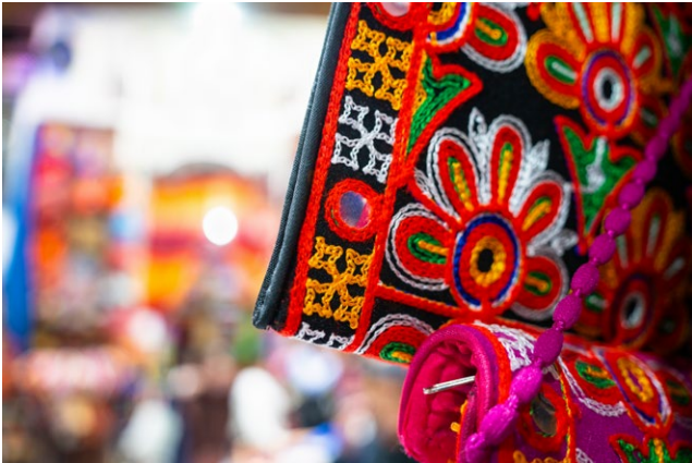
Focal Length: 28mm Exposure: F2.8 1/30sec ISO: 1250

New, innovative all-in-one lens that does it all