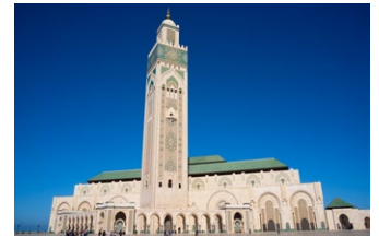
Exposure: F8 1/750sec ISO: 100