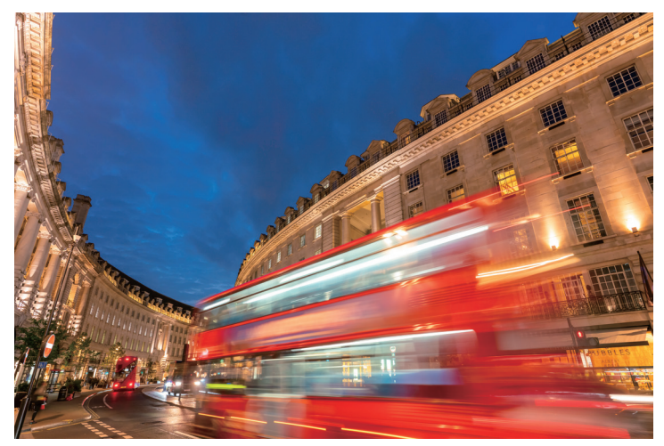
nera: Sony α7R III Focal Length: 20mm Exposure: F6.3 1/5sec ISO: 1000